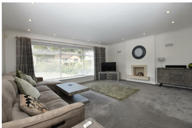
Lounge 17'8" x 15'8" (5.41m x 4.78m )

Two Upvc double glazed windows, two central heating radiators and contemporary wall mounted fire.