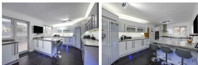
Kitchen / Diner 20'11" x 12'0" (6.38m x 3.66m )

Upvc double glazed door leading to the rear external with side window, two Upvc double glazed windows, central heating radiator, tiled flooring and fitted with a range of white floor and eye level units, contemporary worktops with splashback tiles above, sink with mixer tap, breakfast bar and a host of integrated appliances including double oven and microwave, hob with extractor hood above, two fridges, washer / dryer and American fridge-freezer.